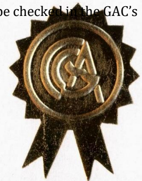
Director General, GCC Accreditation Center